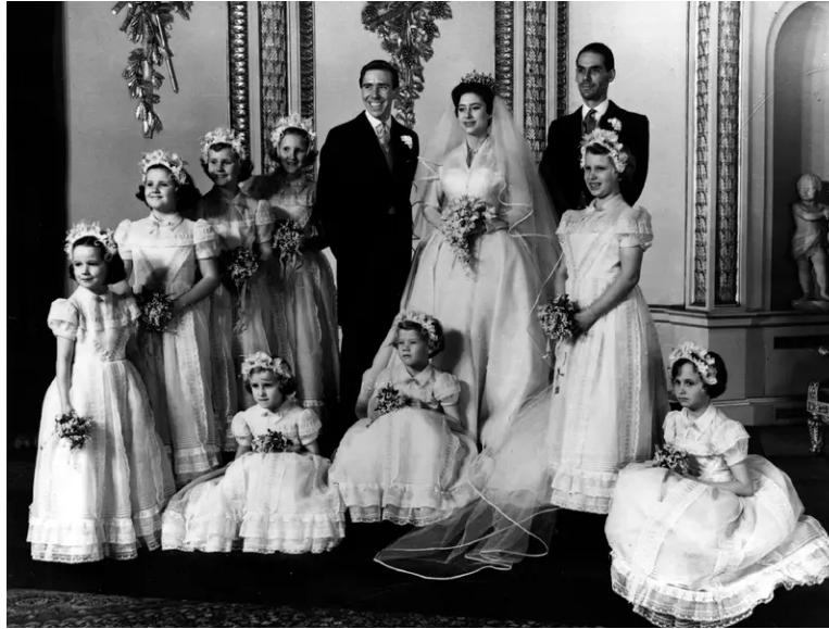
1960 - Princess Margaret's Wedding Day