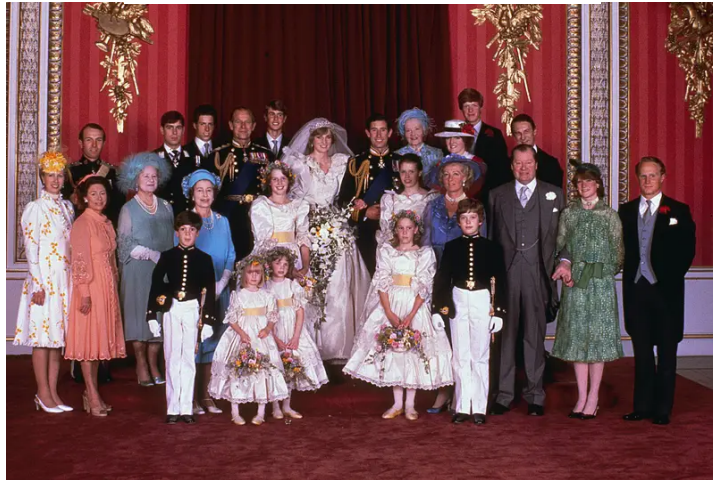
1981 - Prince Charles and Princess Diana's Wedding Day