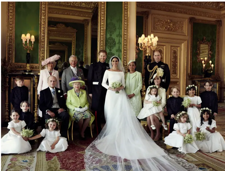
2018 - Prince Harry and Meghan Markle's Wedding Day