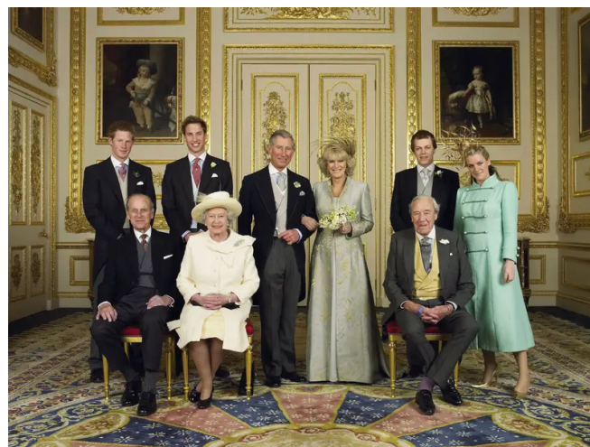
2005 - Prince Charles and Camilla Parker-Bowles' Wedding