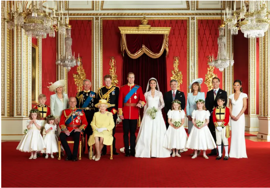
2011 - Prince William and Kate Middleton's Wedding Day