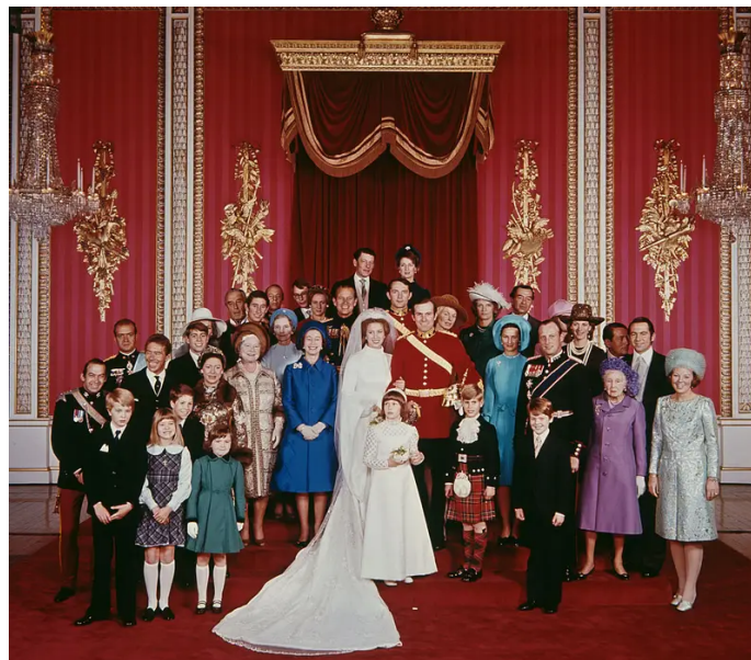
1973 - Princess Anne's Wedding Day