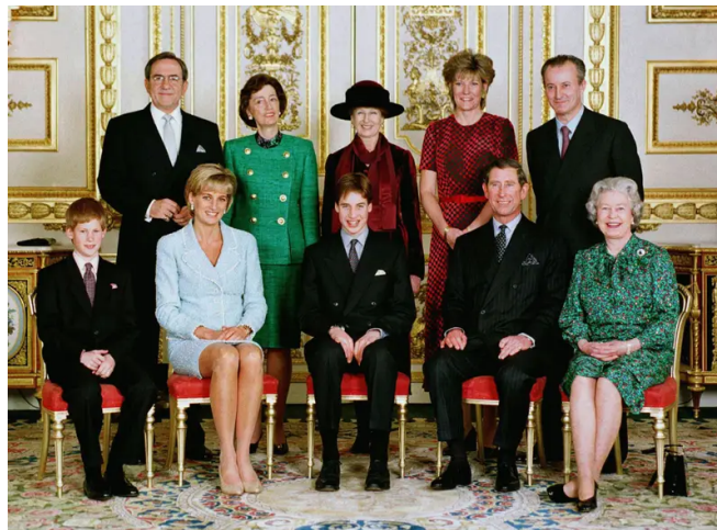
1997 - An official portrait after Prince William's Confirmation